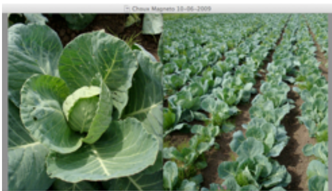
Photo : Test at biodynamic farm in 2009. The cabbages from the magnetoculture treated field were in between 6 and 9 kgs, the ones from untreated fields between 2 and 5 kg. The total yield of the treated field was more then threefold the one of the other fields. Photo from 10 june 2009.